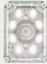
WHITE WITH POLARIZER