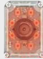
RED WITH POLARIZER