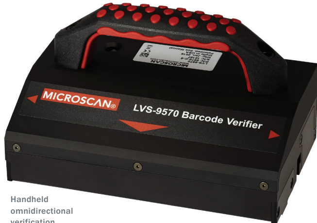
Handheld omnidirectional verification